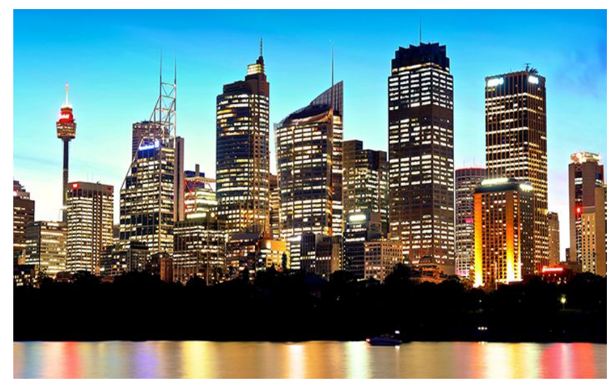
A useful website featuring a comprehensive list of attractions and events in Sydney is: http://www.sydney.com/

The following attractions are all within an easy walking distance from the Amora Jamison Hotel: